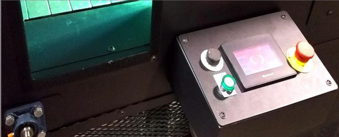
HMI Touchscreen controls with electronic ammeters. E-stop on HMI control box & opposite side of conveyor.