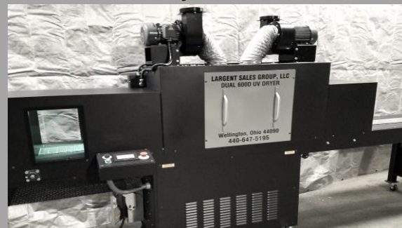
DUAL 600D UV Dryer