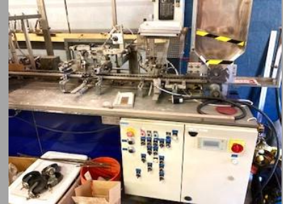
Ardenghi GPE 26 1-color