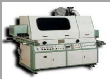
CA-101 automatic screen