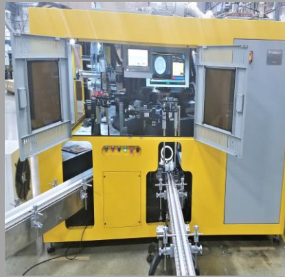
CNC 4-color – new (1) available.

Run 2 semi-automatics. Servo semi-automatic. Non-register non-lug ware. Plastic-ceramic-glass-metal.