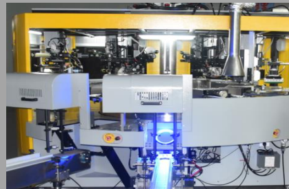
1-color – 8-color systems

German Basler camera system – the best worldwide.