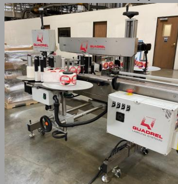
Quadrel Labeler's (2)