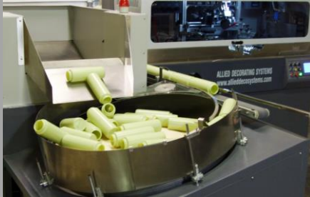
SA-102 feeder unscrambler