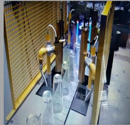
X-Pattern Flame Treater.