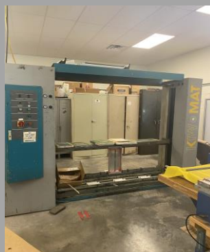
Kiwomat screen coater