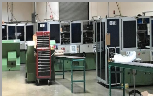
Novax-M 1 + 2-color with Collamats