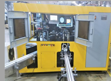
CCD camera = process print

3 X's better registration. Save on tooling, and set-up.