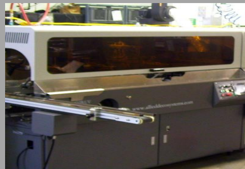
SA-102 – 1 and 2-color