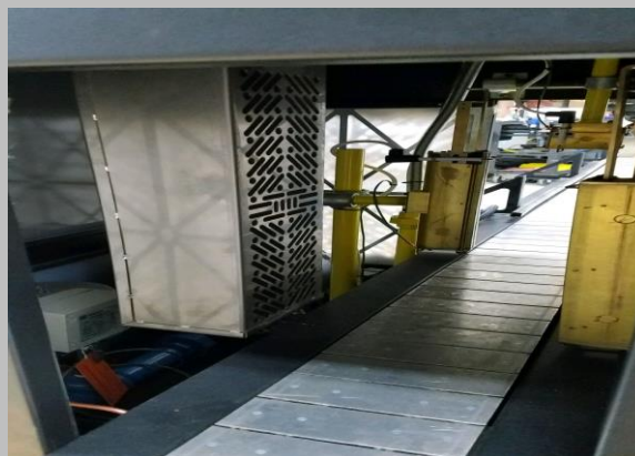
ASK ABOUT FINANCING!

Automatic and semi-automatic systems available in liquid and cartridge Pyrosil units.