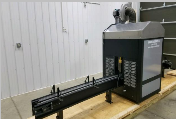
Liquid unit with full automation.

Automatic and semi-automatic systems available in liquid and cartridge Pyrosil units.