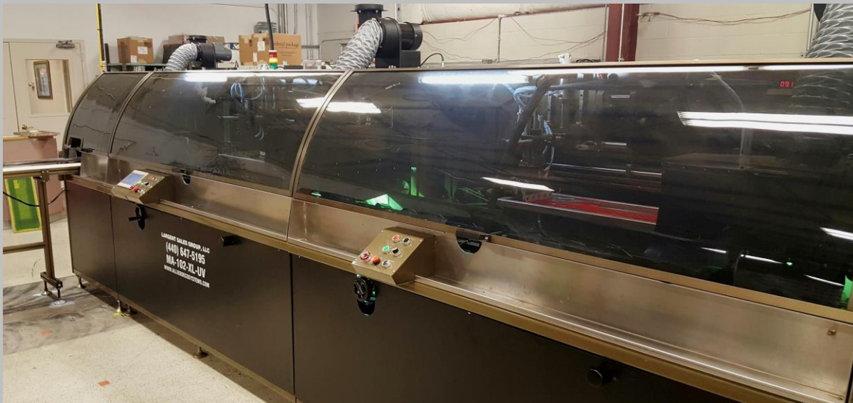
3-COLOR GALLON AUTOMATIC IN PRISTINE CONDITION.