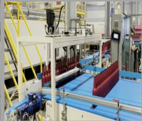
Auto. feeder for lehr