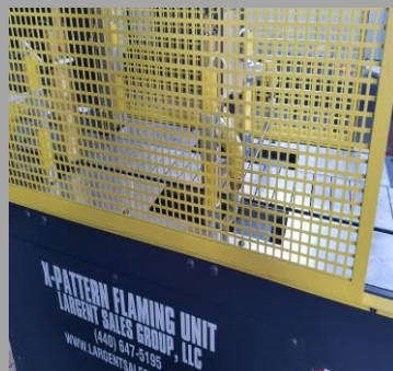
X-Pattern FLAME system