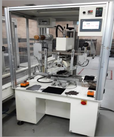
Glass hot stamp system