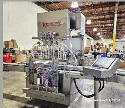
Accutek 4-head filler