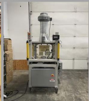
Miller semi flamer