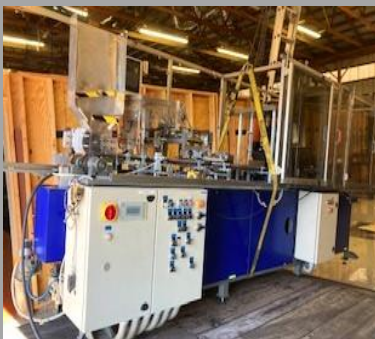
Ardenghi GPE 26 – offer