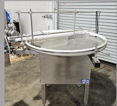
ACCUTEK rotary feed