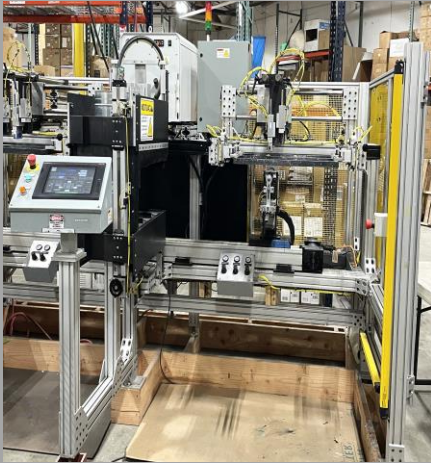
Miller 4-C shuttle with UV