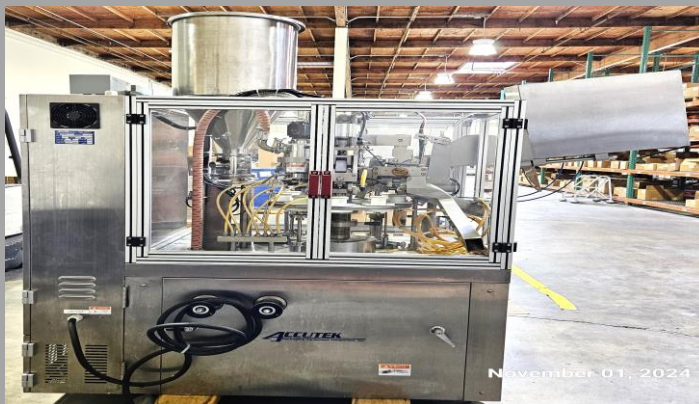
Accutek rotary tube sealer