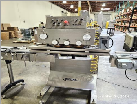
Accutek 4 head capper