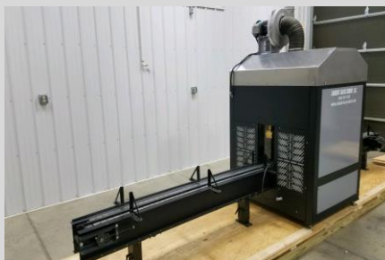
add Pyrosil pre-treatment in-line