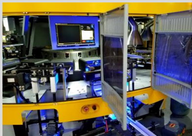
Multi-color 1-8 color