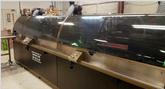
MA-102-XL 3-COLOR GALLON AUTO.

CALL TODAY FOR SPECIFICATIONS AND QUOTATIONS.