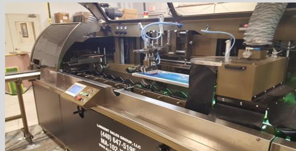
LOW USAGE, DEAD-NUTS REGISTRATION.

IMMEDIATE AVAILABILITY, 400 WPI CURING, HEAVY-DUTY RUGGED CONSTRUCTION.