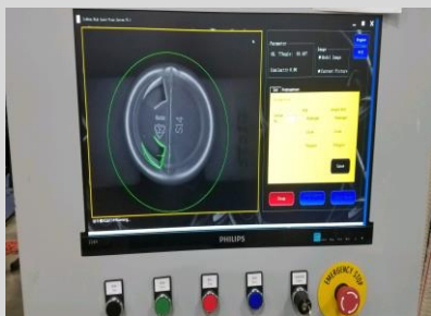
3 times better registration