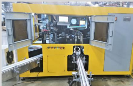
German Basler camera