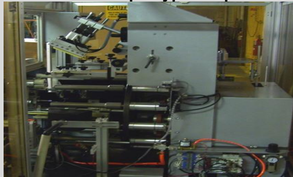
400 WPI tri-power UV system.

Engineering, service, spare parts, & tooling, from our operations in Ohio USA.