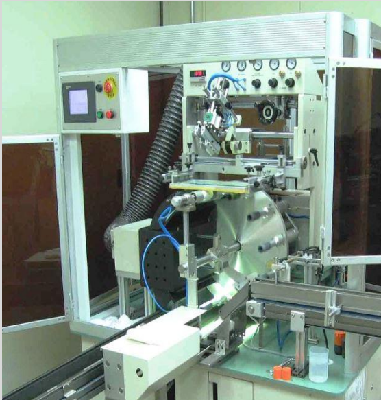
RUV-112 UV automatic screen printer.