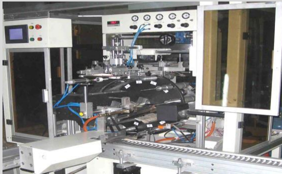
Optional elec. eye register for 2nd. pass.

Various automation connected to the units to feed multiple types of products.